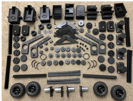
3D printed parts

In implementing this there was a challenge since for suspension a hinge was used at one of the joints where the legs connect to the boat hull which is explained in detail in chapter 5. This hinge was helping the ROBOAT maintain four-point contact when on ground and in rough terrains. Now to obtain a rapid motion during the flipping mechanism this hinge needed to be disabled so that the shaft of the hinge would cause the leg to rotate. For this purpose, a modified clutch mechanism was used to engage the shaft of the hinge to a motor when in water. Basically, the use of DC motors was considered for this purpose, but the mounting of the mechanism was getting too bulky as shown in the Solid works model in Fig.3.3. This mechanism would also assist in the stability of the boat which needed very slight adjustments helping the floats to be on the surface of water which in turn help the boat to float. Such slight adjustments were possible with a DC motor with the help of encoders, but this would have made the mechanism even bulkier to be mounted outside the boat, also this would increase the weight of the boat overall. Later the use of servo motors was considered since these have a very good precision when it comes to control. Also due to their Gearbox the stall torque achieved is also higher as compared to DC motors which would provide more stability.