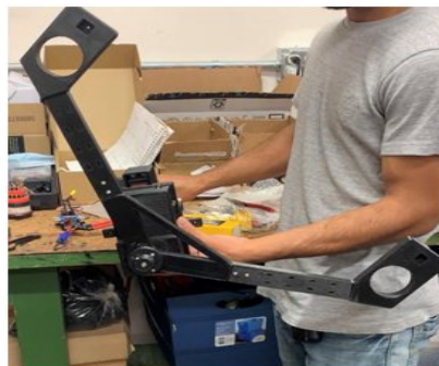
Test for Flipping Mechanism

The boat flipping Mechanism was tested for the 270-degree angle if it could reach with the help of the 35Kgcm servo, when having all the locomotion mechanism mounted. During the experimental test results the servo was hardly able to lift up the leg assembly as opposed to the theoretical calculations in Section 3.1. Since experimental results did not satisfy this condition and hence a servo of 60Kgcm torque was experimented with of which satisfactory results were obtained from the 60Kgcm torque servo after considering losses and full load conditions. The flipping mechanism could not be implemented because of the weight of the boat being higher as opposed to the proportion of the surface area in contact with the water. If the surface area of the boat is to be increased in later prototypes it will help the flipping mechanism a lot. Also, if the boat is to be flipped in water, a float having more buoyant force should be mounted on the legs of the boat to help the boat flip, which is possible only in lightweight or similar rescue boats like these.