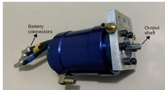
Brushless DC Motor, 3180 KV.

Water jet drive propulsion system uses a propeller, which rotates at very high speeds to create thrust, that helps propel the boat forward at high speeds. For this requirement there was a need for a motor that could deliver very high rotational speeds. Brushed DC motors due to their brushes have a limitation of rotational speed. Therefore, brushless motors were the first choice for this application. A 3180 KV brushless DC motor with 4 poles was selected for this purpose.