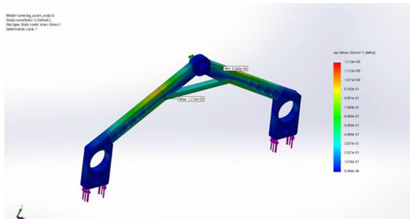
Stress Results for Leg Assembly

As seen in above Figure the intersection where the leg extension meets the bridge support would be subjected to maximum stress of 1.213Mpa which is far within the safety limits of PETG, the material that this part is made.