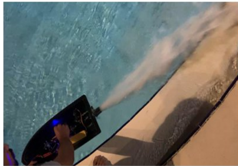
Operation of Jet Drive

The first stage of testing was conducted for its operation in water after the completion of the prototype. This was to test the capability of ROBOAT to drag an object like a rescue float in water in given time. The jet drive system provides a very high speed for the boat in water, to reach any person in need for rescue, dragging a weight/ payload of 5lbs without affecting the performance. As the weight of the payload goes on increasing it causes a reduction in speed of the boat. Maximum weight that can be dragged in water by the boat is 11lbs for safe operations.